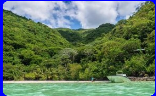
Mountain and beaches

The school is located in the Mountain of the city