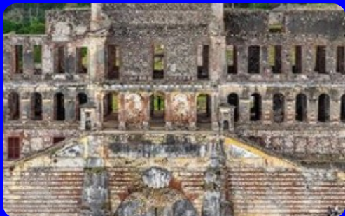
Palais Sans Souci