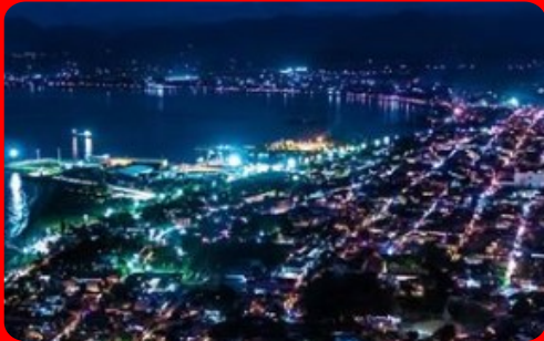
Night view of the town

Mountains and beaches are close to each other. Fifteen minutes from the school