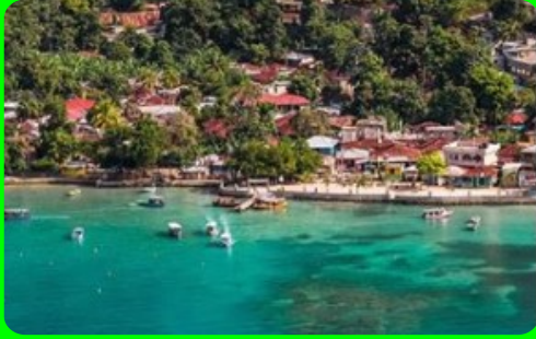
Cap- Haitian, the City

The school is located in the Mountain of the city