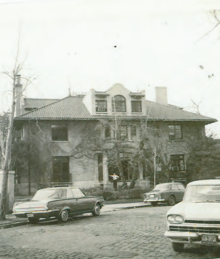
The first ELS centre was established in Washington D.C. in 1961.