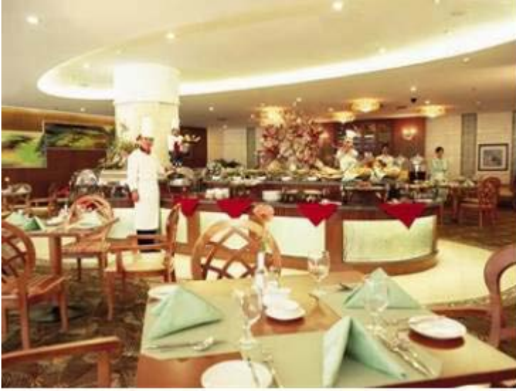
丽苑西餐厅 Gui Yang City 云岩区瑞金北路 115 号 丽豪大饭店 1 楼 Yun yan qu rui jin bei lu 115 hao li du hao da fan dian 1 lou (0851)6521888, (0851)6616115