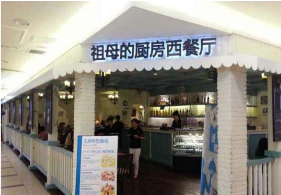
祖母的厨房 Guanshanhu Area 观山湖区世纪金源广场国贸一楼 Guan shan hu qu shi ji jin yuan guang chang guo mao 1 lou 喷水池南国花锦负一楼 Pen Shuichi Flora Plaza Fu yi lou