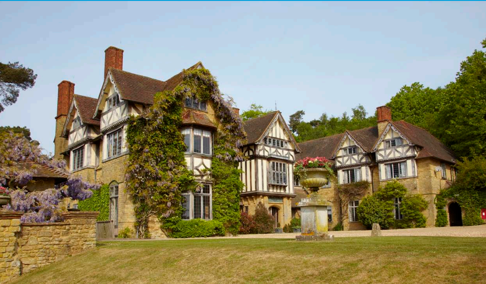
Hurtwood House, Main School Building