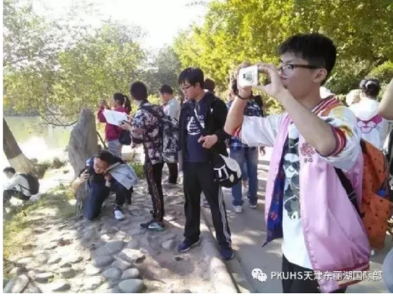
SPRING OUT---TRIP TO BEI JING