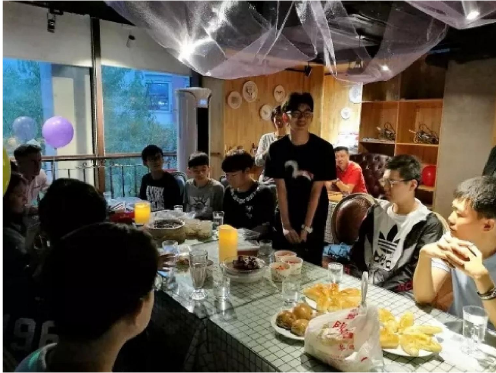
WELCOME NEW FRIENDS