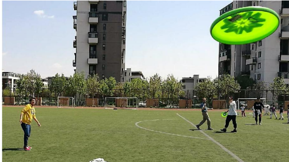
PE CLUB: FRISBEE