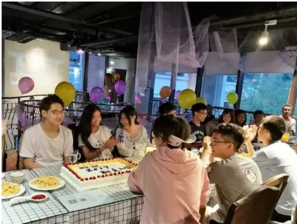
WELCOME NEW FRIENDS