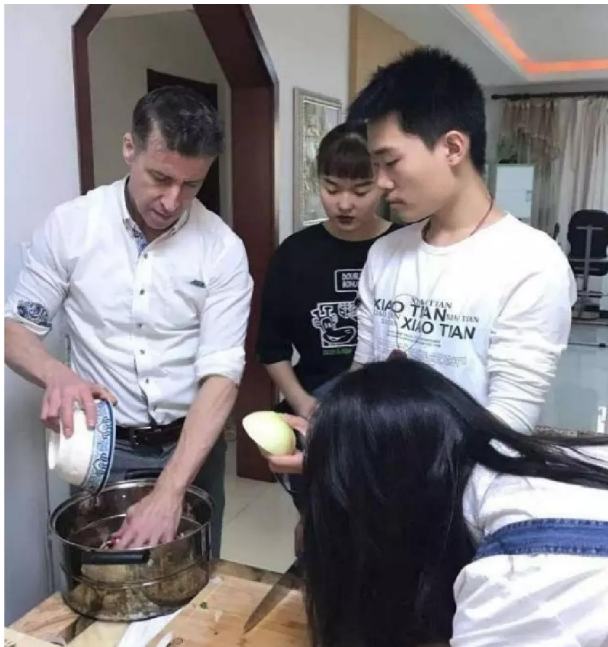
COOKING CLUB: HAVE FUN