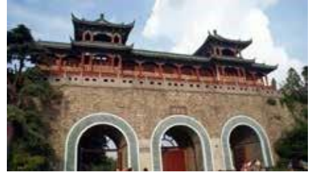
XUAN WU LAKE